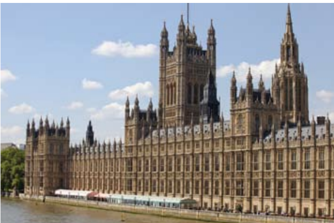
Rockbond Waterstop Mortar and Rockbond Flexible Membrane to seal and waterproof the walls of the restaurant below the level of the river Thames at the House of Lords, The Palace of Westminster.