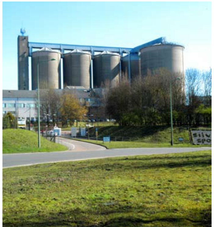
Rockbond Abrasion Resistant Mortar and Floor Screed Steel Reinforced used for flume and flatbed repairs at British Sugar.