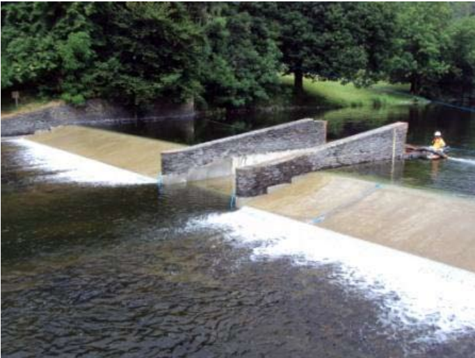
Rockbond Underwater Mortar used to repair the bridge and weir at Newby, Ulverston