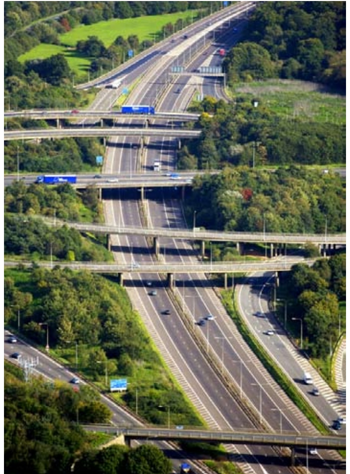
Rockbond Fastrock Concrete used to repair carriageway concrete on the M25.