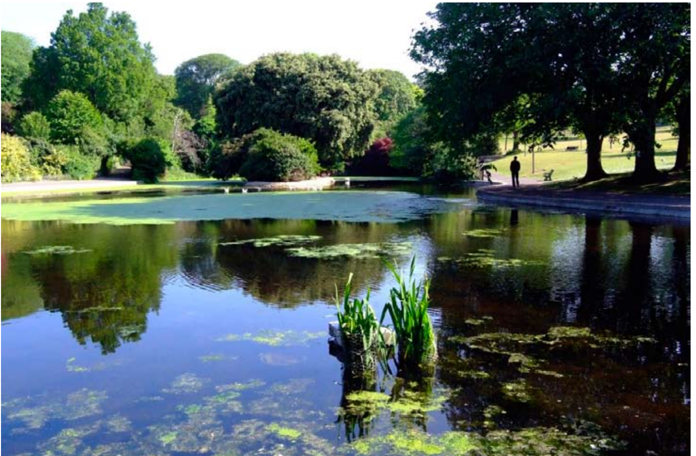
Rockbond Underwater Mortar used to repair the concrete at Queen's Park Lake, Brighton.