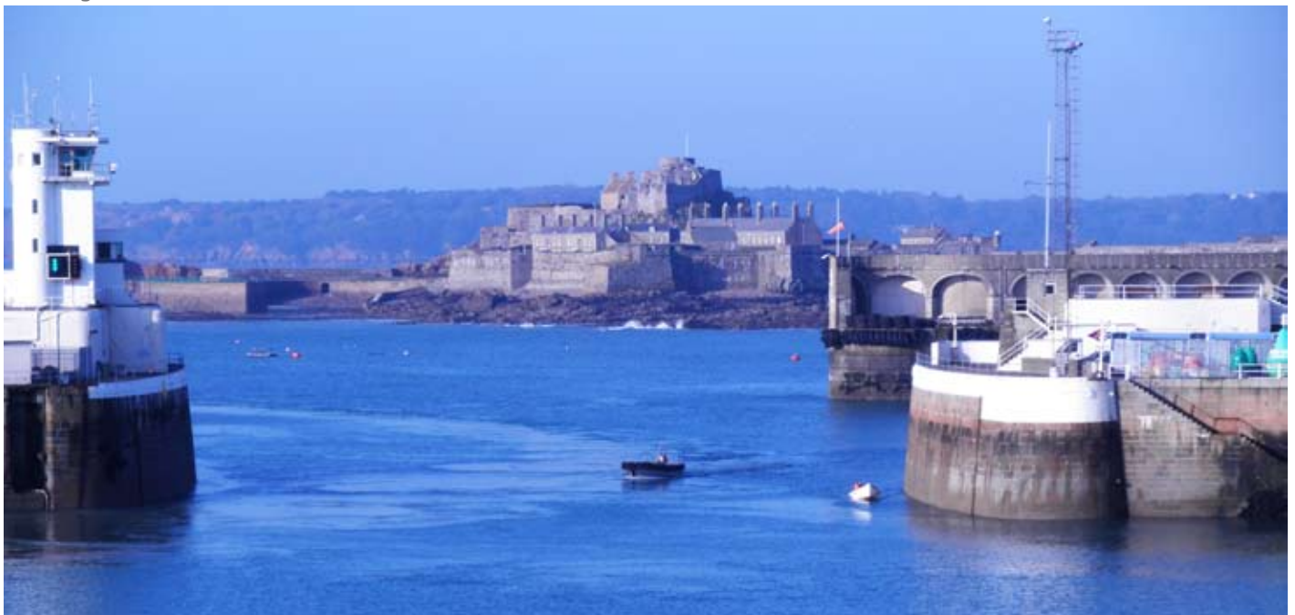
Rockbond Underwater Mortar use to protect concrete piers against scour attack at the Queen Elizabeth Ferry at Jersey Port, Channel Islands.