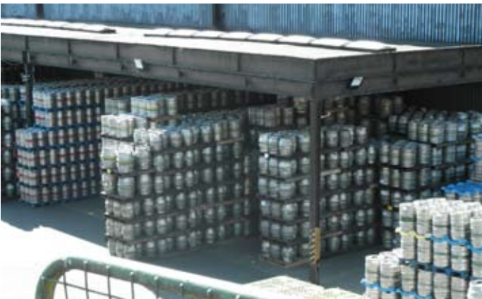
Rockbond Floor Screed Steel Reinforced to repair the floor and loading bay areas at the Green King brewery, Bury St. Edmunds, Suffolk.