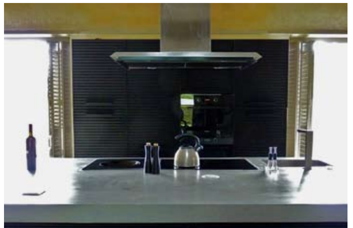
Rockbond WorkTop Concrete for casting concrete countertops, worktops and furniture for home and garden.